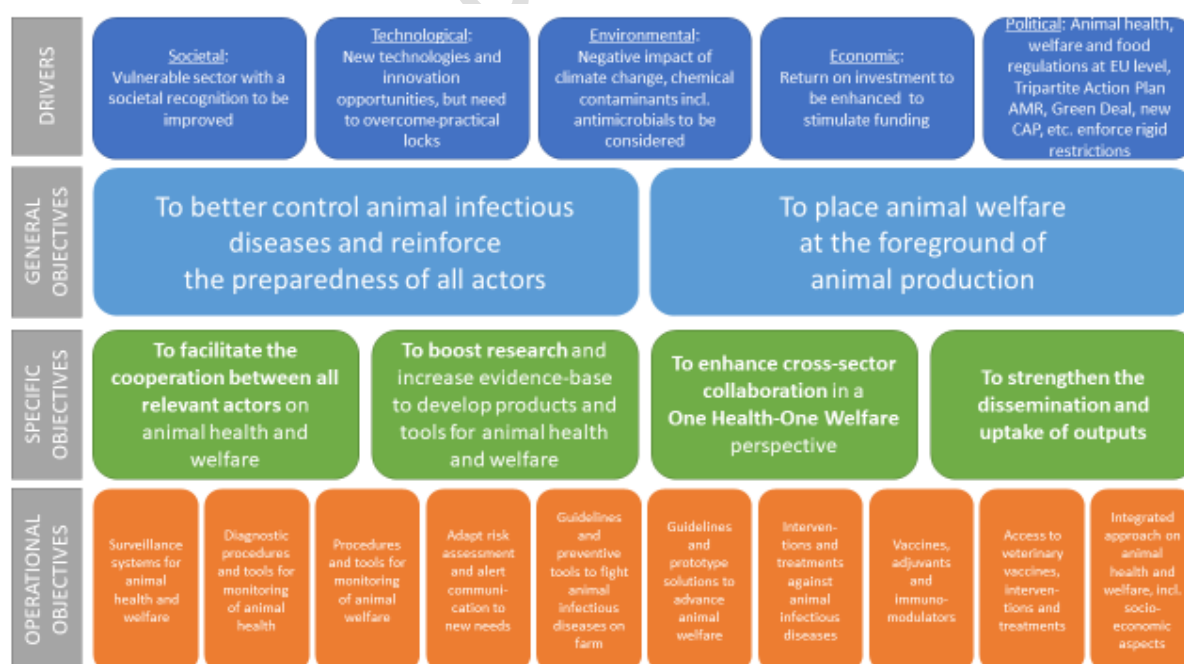
Figure: Intervention Logic of PAHW

The diagram below summarises the problems and drivers identified above (2.1 Context and problem), as well as the general, specific and operational objectives of PAHW.