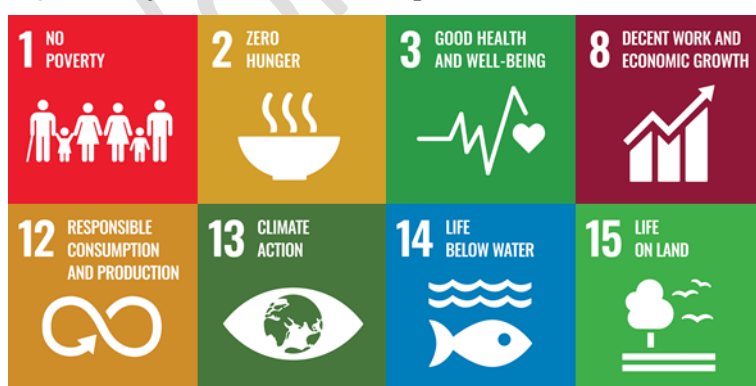
Figure: Major Sustainable Development Goals in relation to PAHW

Since the challenges described above are not restricted to the European continent, networking with international projects and initiatives will be sought and international cooperation